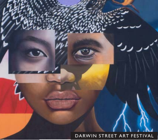
DARWIN STREET ART FESTIVAL