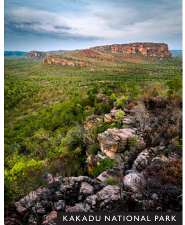
KAKADU NATIONAL PARK

THE QUIRKY CROC-SHAPED MERCURE KAKADU CROCODILE HOTEL IS THE PERFECT BASE TO EXPLORE THE WETLANDS AND WILDLIFE OF KAKADU NATIONAL PARK, JUST THREE HOURS OUT OF DARWIN. ALL.ACCOR.COM