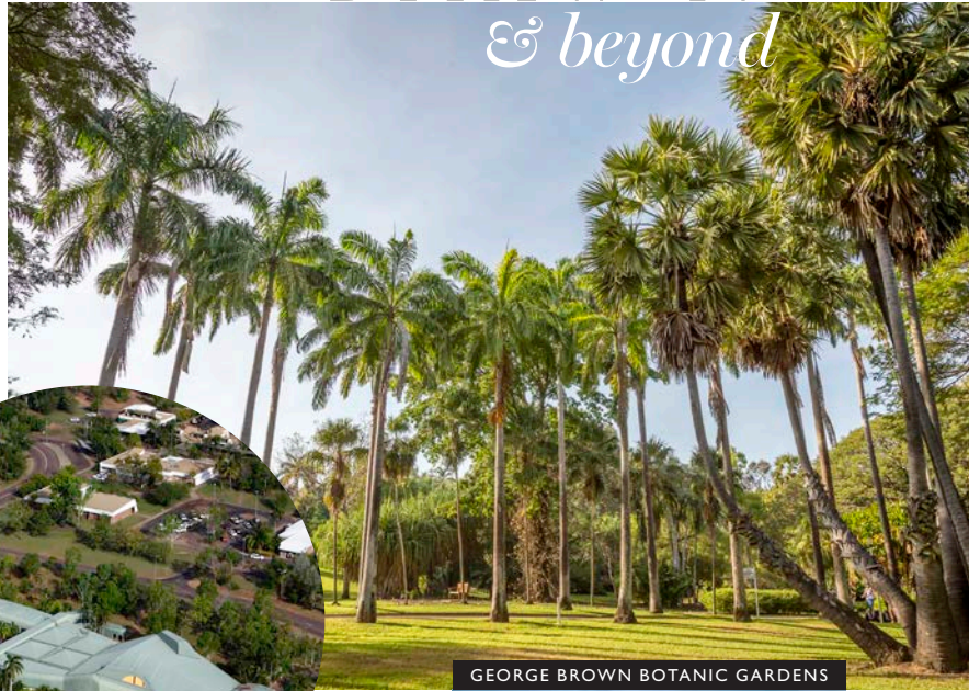
GEORGE BROWN BOTANIC GARDENS

Darwin's annual STREET ART FESTIVAL , held in September, brings artists from all over Australia to paint the city's walls in color. If you can't make the event itself, download the walking map to see multistory murals from previous years. darwinstreetartfestival.com.au